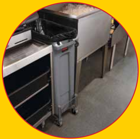
SLIM JIM® CONTAINERS