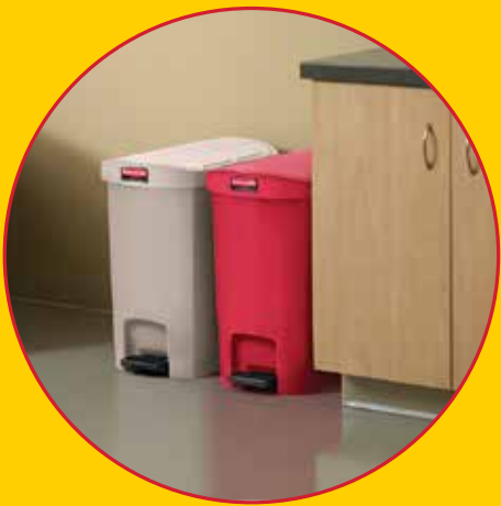
SLIM JIM® STEP-ON